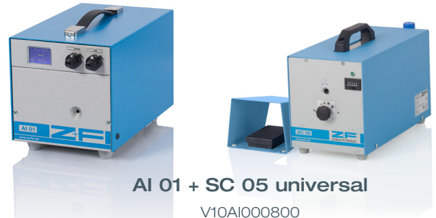
AI 01 + SC 05 universal

Adapting different sleeve cross-sections can easily be done by turning a knob on the front of the machine panel. Further adjustments are not necessary.